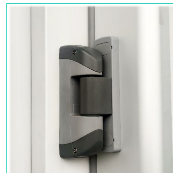
3. Rising Hinges