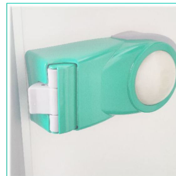
2. Coldroom int. lock